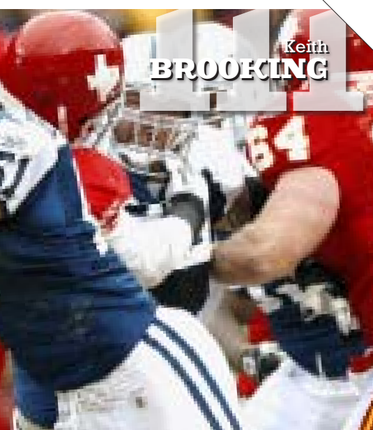
141 Keith BULLUCK